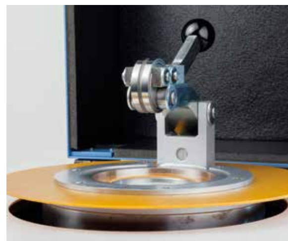
Manual clamping device with and without grinding vessel (50 ccm)