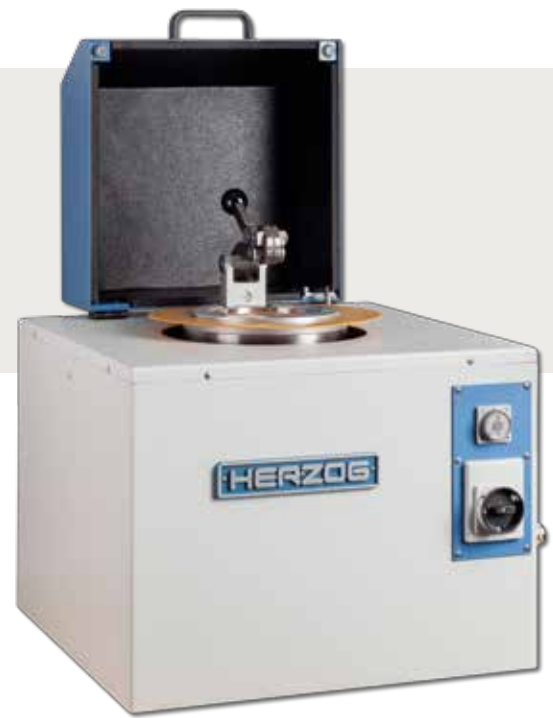
Easily accessible clamping device

After closing the flap the machine is locked during the grinding operation by a safety switch. The grinding vessel is manually removed from the machine and the ground material can be discharged for further processing. The machine is totally enclosed, sound insulated and requires a minimum of operator's time and maintenance. Safety switches automatically deactivate the machine in case of malfunctions during operation.