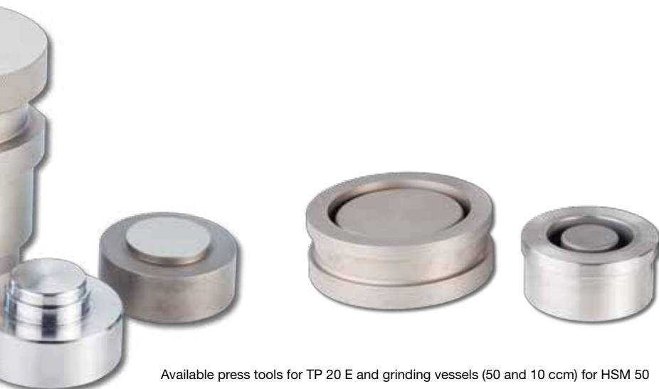
Available press tools for TP 20 E and grinding vessels (50 and 10 ccm) for HSM 50