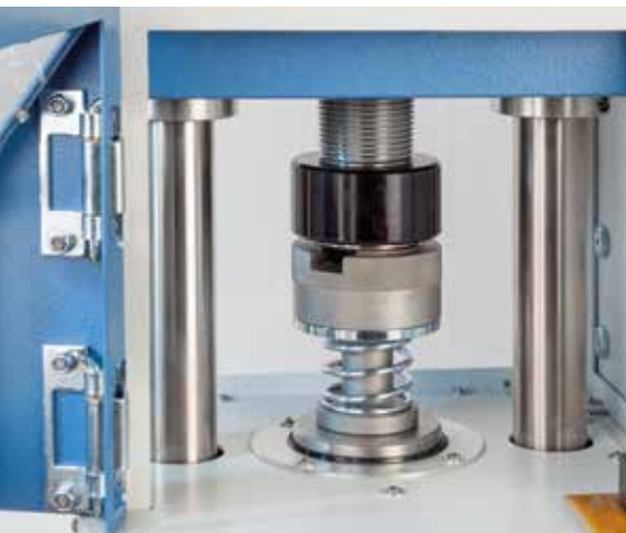
Press tool of TP 20 E

For safety reasons it is not possible to open the input/ output flap during the complete process. The flap is released as soon as the piston is retracted completely. Then the press tool with the pressed pellet can be removed and the machine is ready for the next sample.