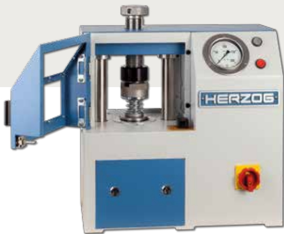
Access to the press tool via safety flap